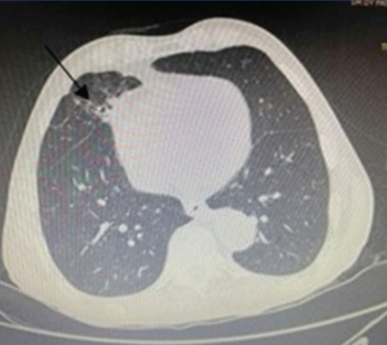
[Table/Fig-3]: High Resolution Computed Tomography (HRCT) thorax showing traction bronchiectasis in the medial segment of the right middle lobe. [Table/Fig-4]: HRCT thorax showing fibrotic infiltrates in apical and apico-posterior segment of bilateral upper lobes. (Images from left to right).

maturation arrest, megakaryocytes were normal. These features were suggestive of Chronic lymphocytic leukaemia (CLL). Flow cytometry revealed 70% mature lymphocytes and 95% of total lymphoid cells expressed Cells of Differentiation (CD)5, CD19, CD20, CD22, CD23, CD200, Human leukocyte antigen (HLA)-Dendritic (DR) and lambda light chain, SmlgM, SmlgD. Co-expression of CD5 and CD19 was seen in 91% of total lymphoid cells. Findings were consistent with B-Chronic lymphocytic leukaemia/small lymphocytic leukaemia (stage 5).