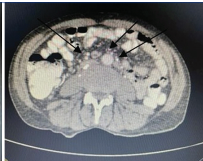
[Table/Fig-1]: Magnetic Resonance Imaging (MRI) brain showing old bleed in left thalamo-capsular region. [Table/Fig-2]: Contrast Enhanced Computed Tomography (CECT) Antero-posterior (AP) showing multiple enlarged discrete lymph nodes in pre aortic, bilateral para-aortic, retroaortic and retrocaval region. (images from left to right).

High Resolution Computed Tomography (HRCT) thorax revealed fibrotic infiltration with traction bronchiectasis in medial segment of right middle lobe along with fibrotic infiltrates in apical and apicoposterior segment of bilateral upper lobes. Enlarged pretracheal and precranial lymph nodes were also seen [Table/Fig-3,4].